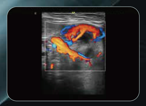
Canine Abdomen- Renal Flow