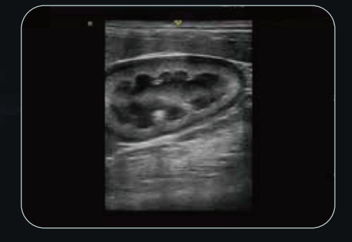
Feline Abdomen-Long Axis of Kidney