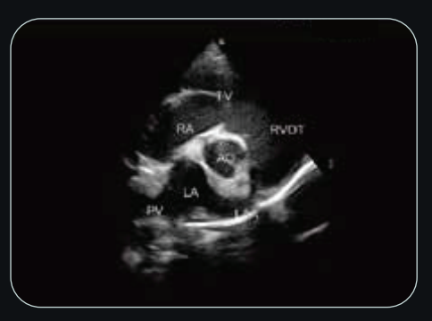
Canine Heart-Short Axis of Aorta