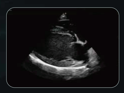
Canine Heart-Long Axis of LV