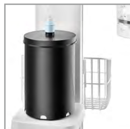
Gas filter canister